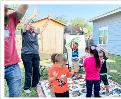
Friendship House Backyard Bible Club June 17–20 9:00–11:00 a.m.