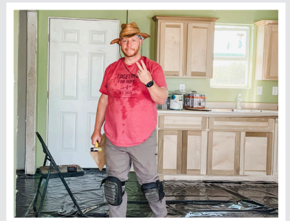
McAllen Mission Trip Construction Team July 11–14 or longer Family Team July 14–19