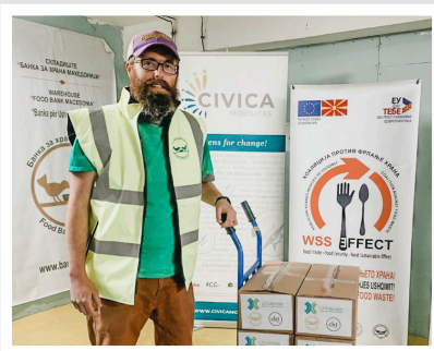
Macedonia June 2024

Please begin to pray how you can be involved in any or all these opportunities! Watch for more details coming soon!