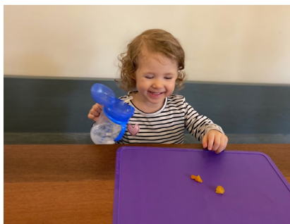
We are excited that this month we finally got a dining table after 6+ months living in this home. It was a weird saga full of termites and other turns, but now we are excited about the life and ministry that will happen around this table.