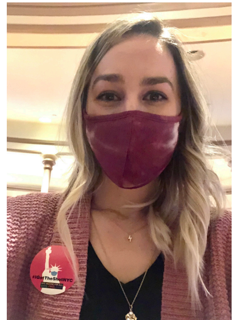
(Those tear-filled eyes and gratitude-filled heart brought to you by vaccine dose !)