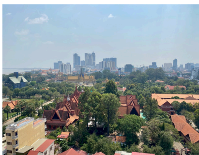
A peek at Phnom Penh's ever changing skyline.