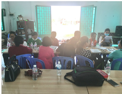
Small groups working on discussion questions during the Kampot seminar.